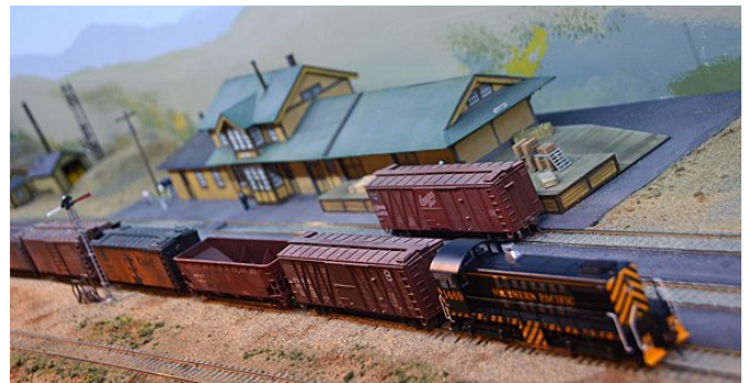
Surf, on the Central Coast Model Railroad located at the Museum.