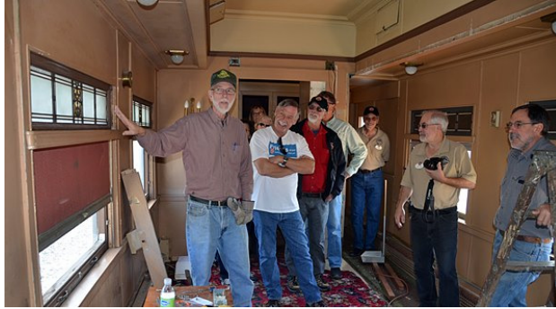
The mid-section of the La Condesa is undergoing considerable renovation.

The Santa Maria Valley Railroad sponsored a private tour of the San Luis Obispo Railroad Museum for members of the Friends of the Santa Maria Valley Railroad. The tour was followed by lunch (of course) at Del Monte Cafe (right across the street from the Museum).