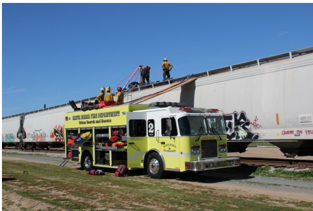
Urban Search and Rescue Truck at work