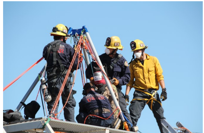
Tripod setup to lower rescuer