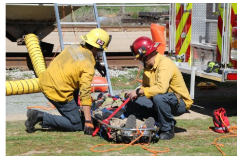
Crew attend to victim

Friends of the Santa Maria Valley Railroad P.O. Box 1031 Santa Maria, CA 93456-1031