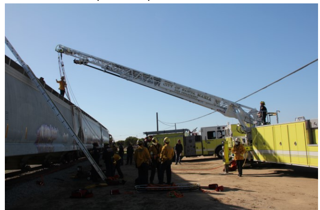
Ladder truck lowering rescuer